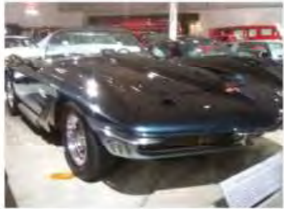
Mako Shark I