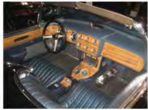
Mako Shark Interior