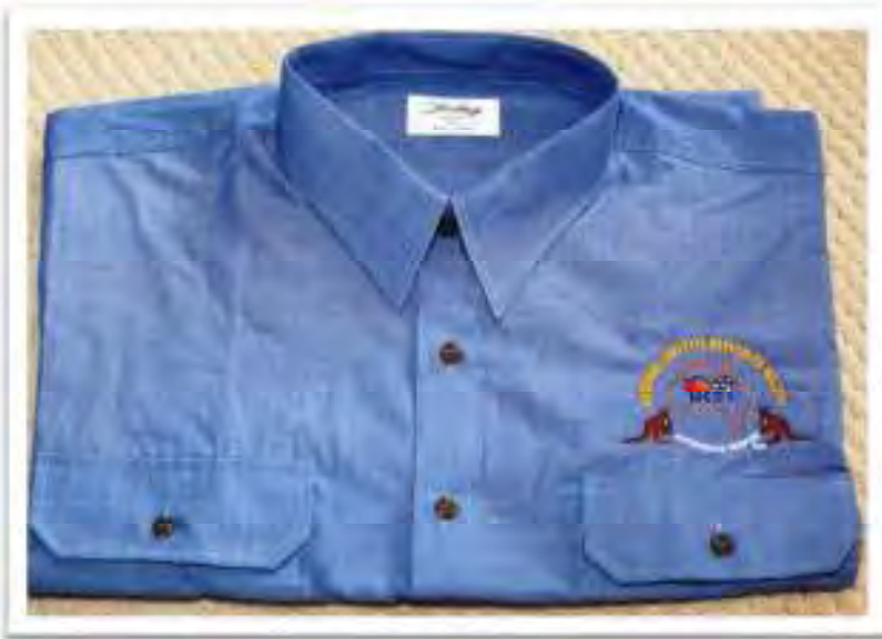
BLUE DENIM $35.00