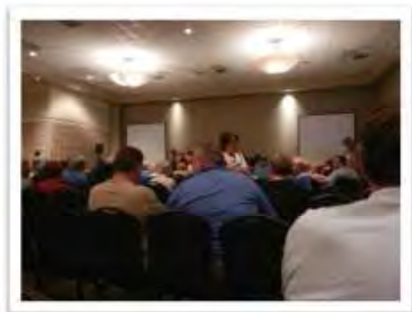
Back to school

The maximum judging points you can earn at a National event is 15 points if you are fortunate enough to be picked as a judge, being 5 points per day. But as a Non Judge you can only earn 10 points, so in some cases it pays to attend these seminars as well as do Operation Judging to achieve your points.