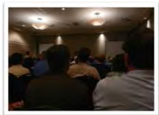
Great seminar on paint