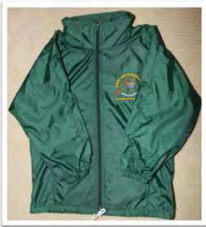
WINDCHEATER JACKET $45.00