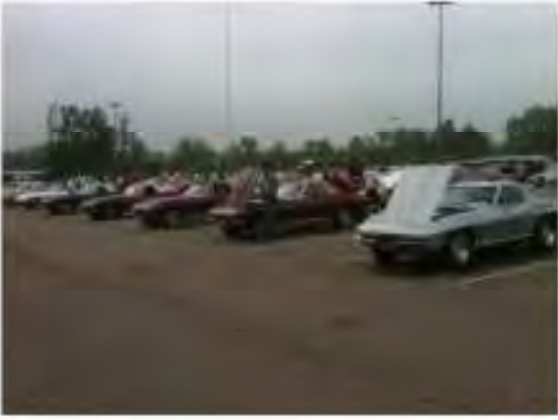
66 Novi Car Park Shot