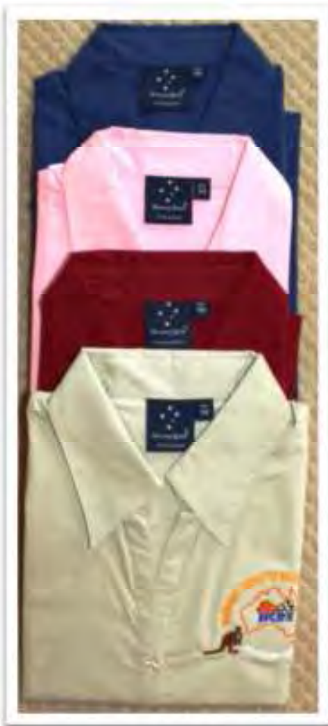
LADIES SHIRTS $ 35.00