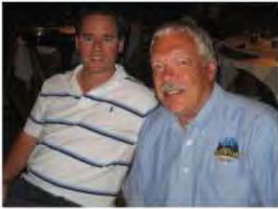
Boys at Dinner