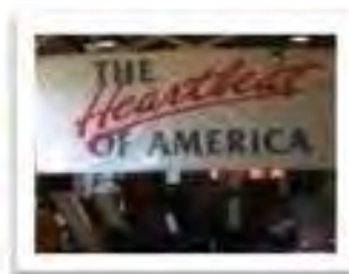
Richard Stones (photo coming)