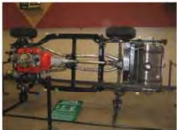
71 Big Block rolling Chassis (Side On)