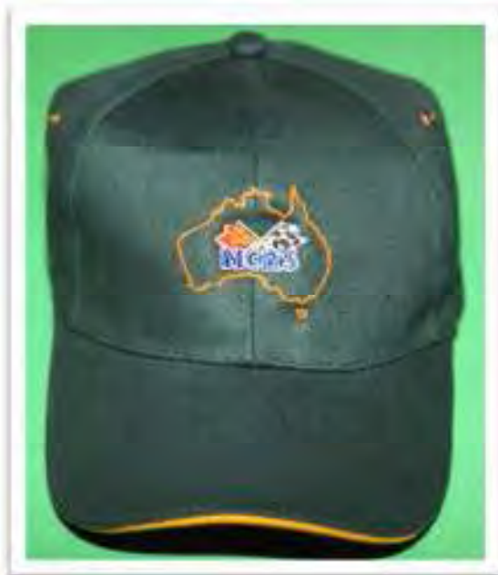
CAP $ 15.00