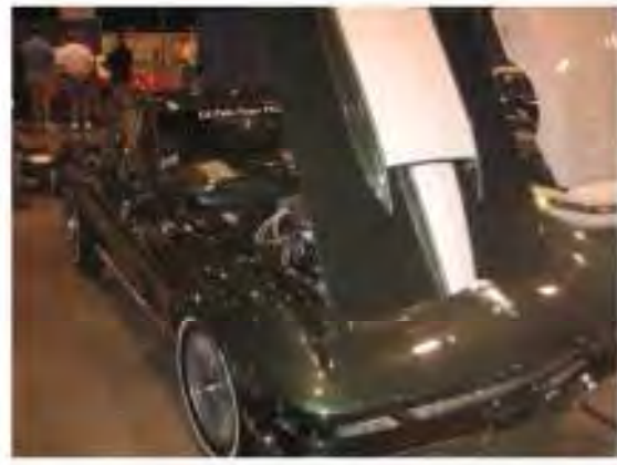
67 L89 Shot 1