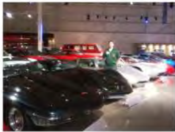
Corvette Concept Cars