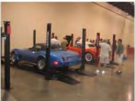
Rack um, stack um, and judge um