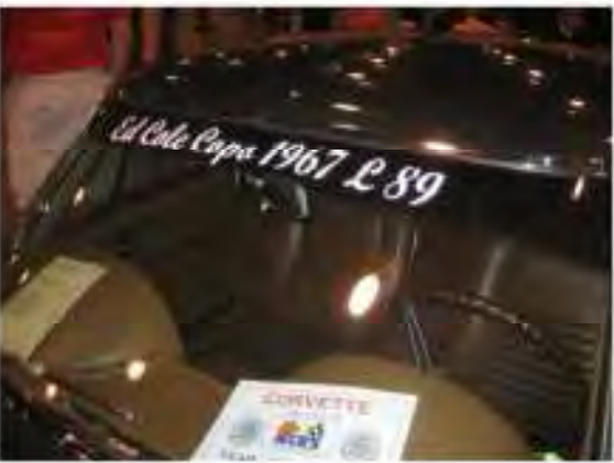
67 L89 Shot 2