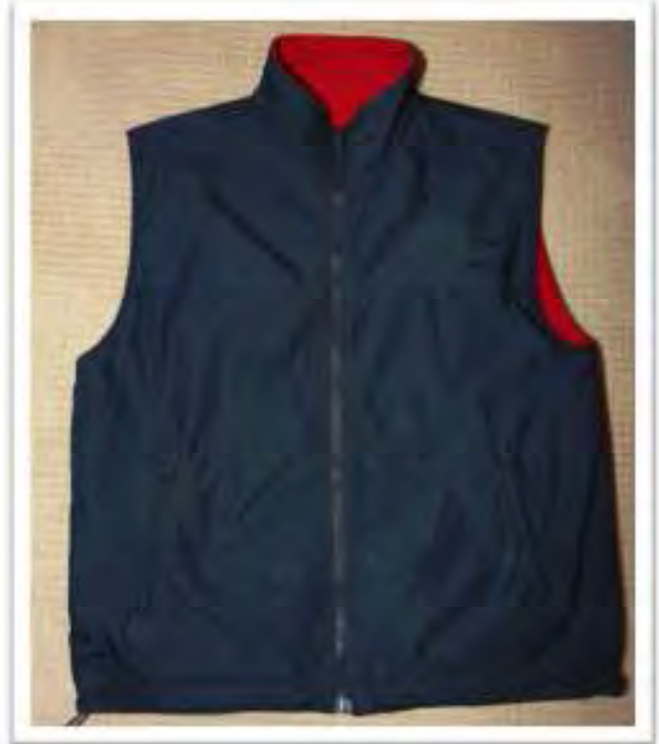
WOOLLEN VEST $38.00