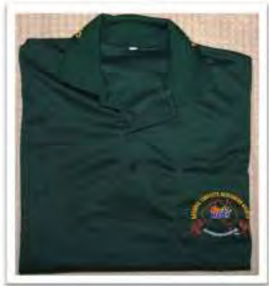
GREEN POLO $ 40.00